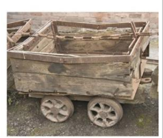
Unit Construction Costs from the New Smelter of the Arizona Copper Co., Ltd.