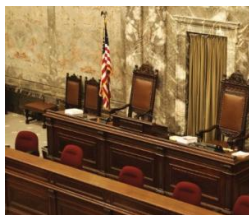
CRS Report for Congress: Medicaid: The Federal Medical Assistance Percentage: February 2, 2009 - RL32950