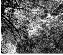
THE SECOND JUNGLE BOOK (ANNOTATED & ILLUSTRATED) Rudyard Kipling