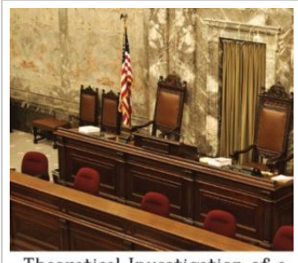
Theoretical Investigation of a Proportional-Plus-Flicker Automatic Pilot