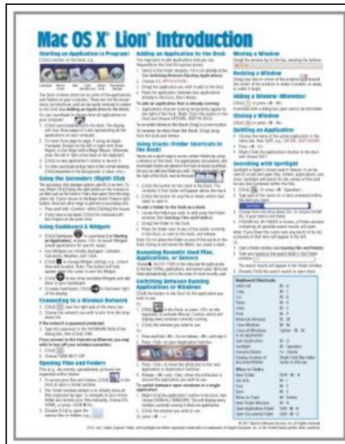
Filesize: 7.82 MB