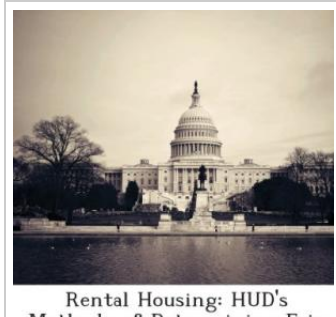
Rental Housing: HUD's Methods of Determining Fair Market Rents: RCED-86-209

U.S. Government Accountability Office (GAO)