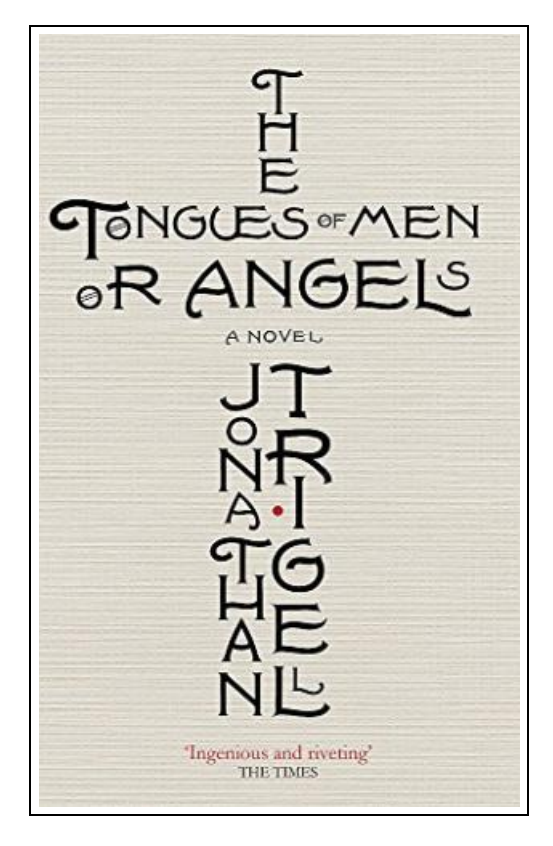
Filesize: 2.99 MB