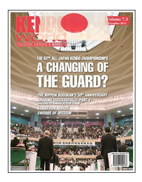
Filesize: 2.95 MB