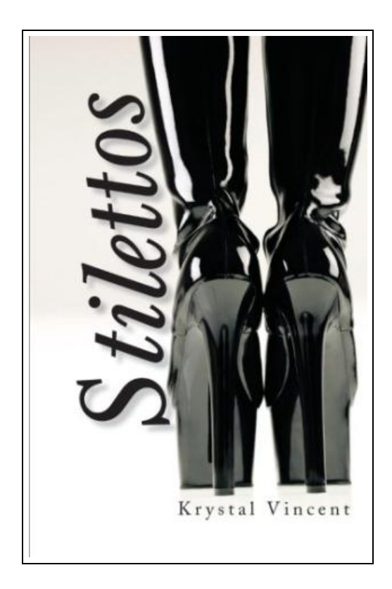
Filesize: 5.45 MB