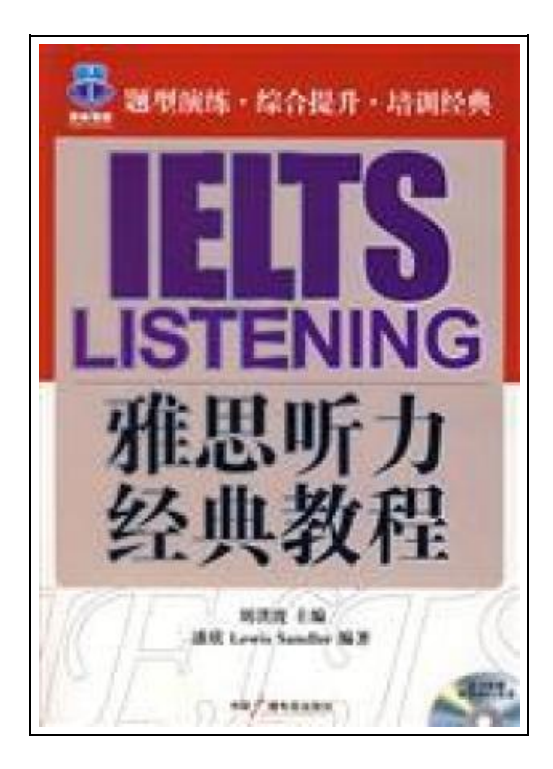
Filesize: 5.43 MB