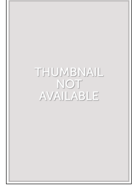
Filesize: 6.45 MB