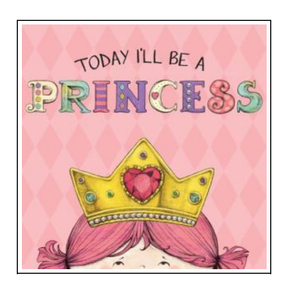
Filesize: 8.49 MB