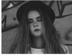
Maggie, a Girl of the Street Stephen Crane