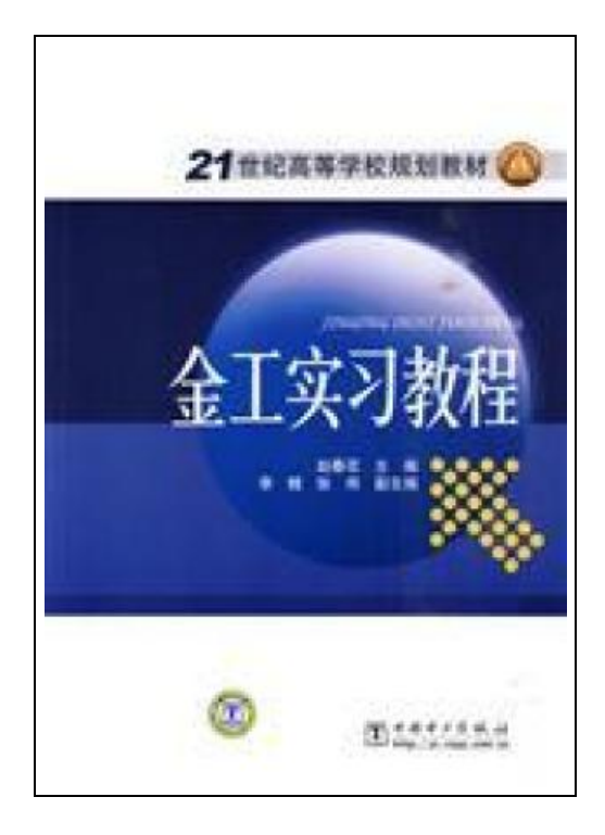
Filesize: 8.44 MB