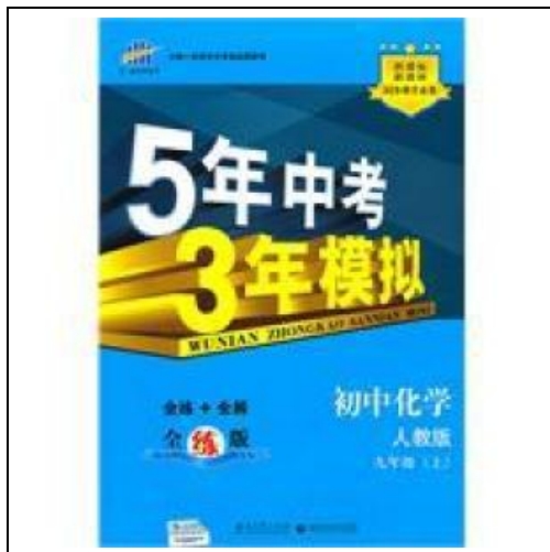
Filesize: 3.45 MB

Junior high school chemistry - the ninth grade (Vol.1) - PEP - 5 years in the three-year test simulation - Full training version - new materials. new curriculum must simultaneously classroom - (with