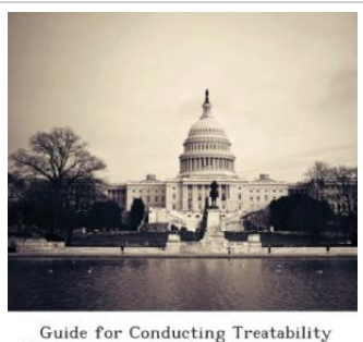
Guide for Conducting Treatability Studies under CERCLA: Biodegradation Remedy Selection, Interim Guidance