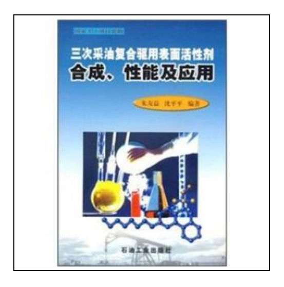
Filesize: 5.11 MB