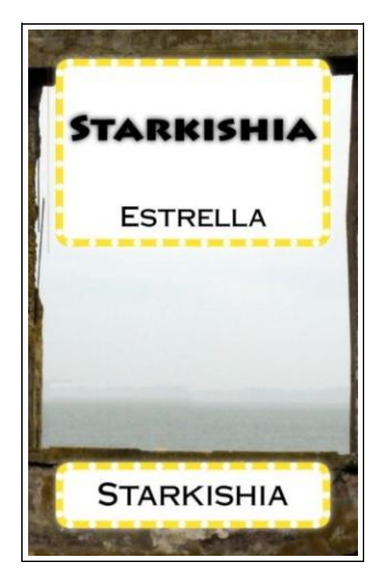
Filesize: 2.11 MB