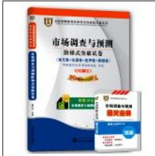
Filesize: 4.66 MB