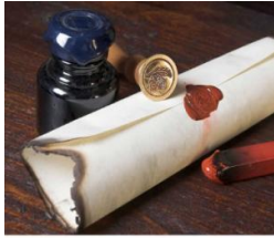
WAR EXPENDITURES: HEARINGS ...