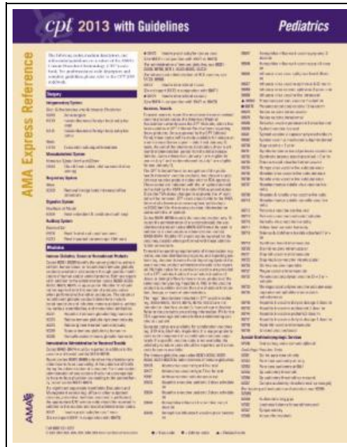
Filesize: 2.49 MB