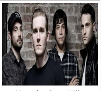
How Anthem Kills Children with Autism