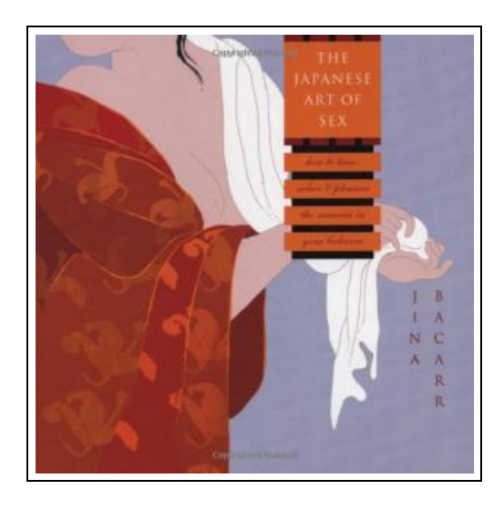
Filesize: 4 MB