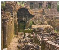
IN TRANSIT, VOLUME 11, ISSUE 3...